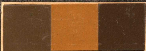
DRAB BUFF CHOCOLATE