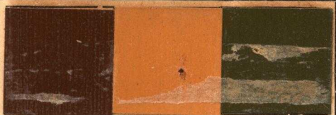
L. BROWN SALMON SAGE