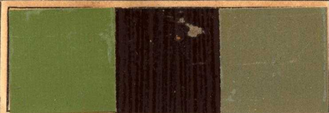
UAP. GREEN D. BROWN GRAY