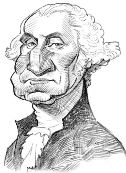
Who is this?