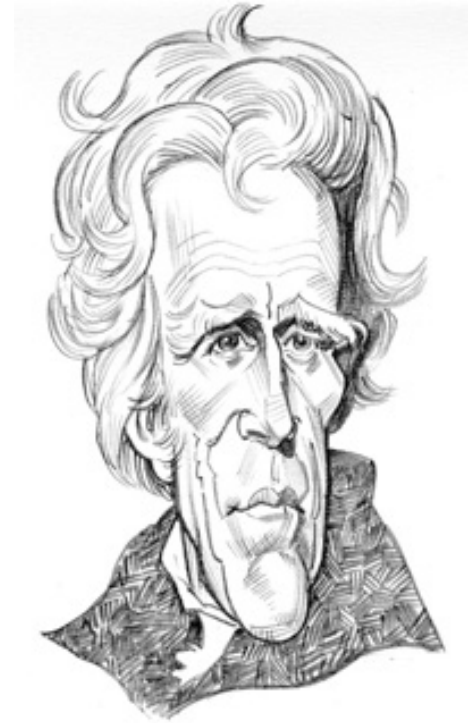
Who is this?